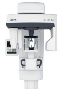
KaVo OP3D PRO