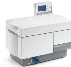
Coltene BioSonic UC125