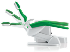
KaVo 1058 Life