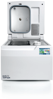
Mocom Tethys H10